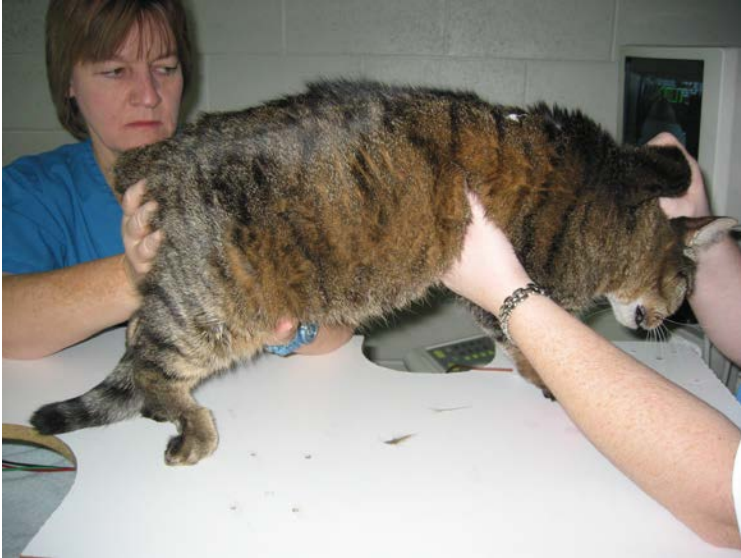
Figure 2: Arterial thromboembolism (FATE) in a cat with HCM. A blood clot originating from the heart has obstructed the distal aorta, blocking blood flow to the hind limbs. His hind legs are paralyzed with inability to rectify the position of his paws (knuckling).