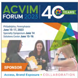
Sponsor Square Graphic 1080 x 1080 px Download JPEG