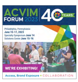
Exhibitor Square Graphic 1080 x 1080 px Download JPEG